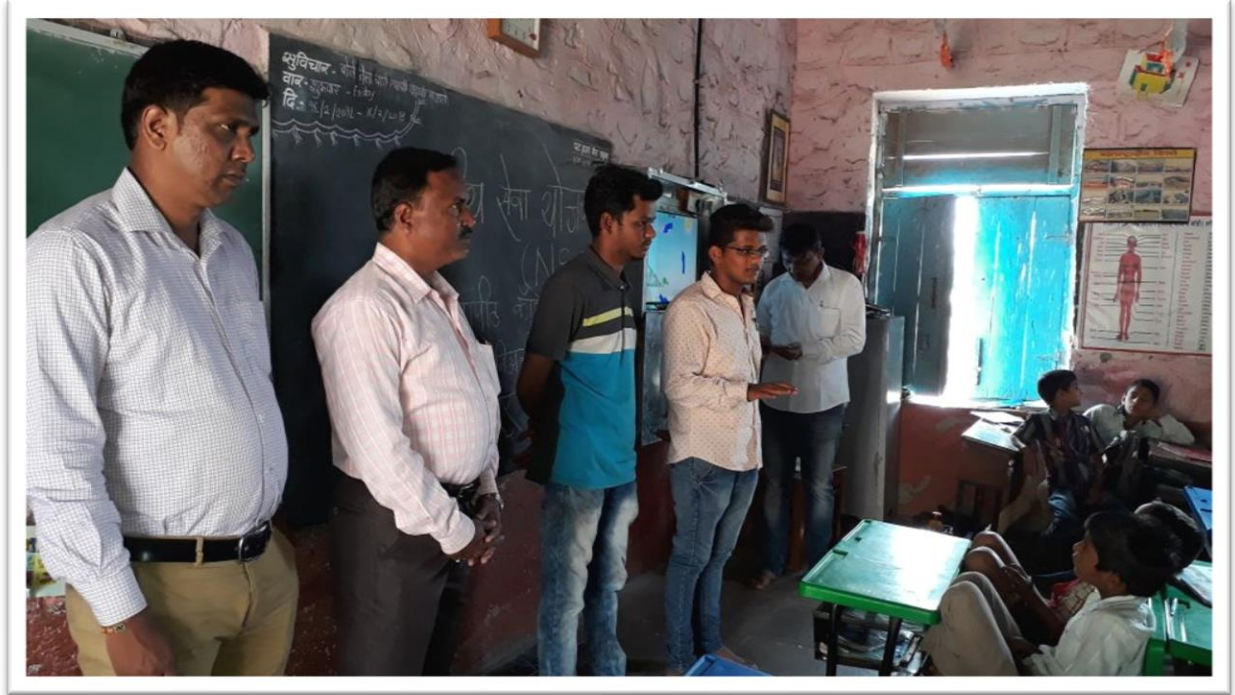
NSS coordinator & All NSS Volunteers Delivering Information about basics of Computer.