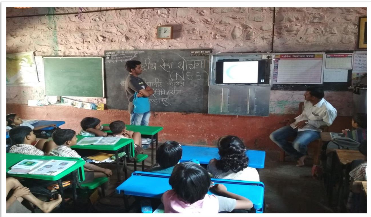
Demonstration of 'e-Learning' Through LED TV, At Primary School.