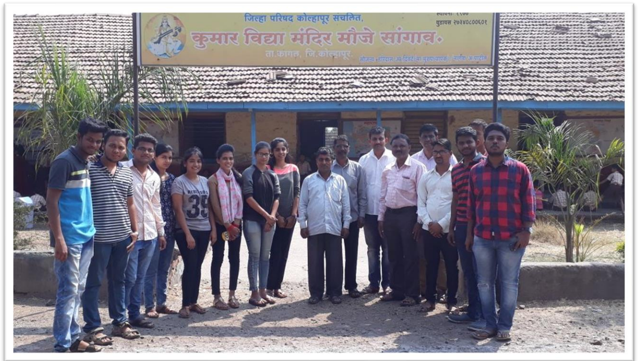
Primary School Staff. & NSS.Volunteers.