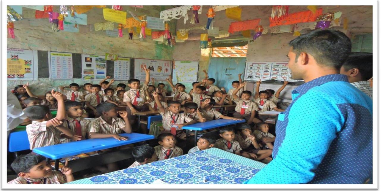
Information & Science Quiz at Primary School.